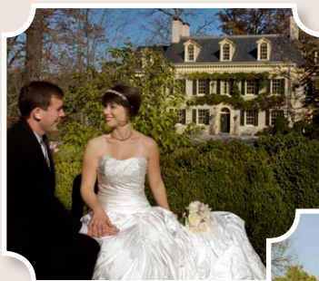
E. I. du Pont Garden

Toscana Catering at Hagley is our exclusive wedding caterer. Contact Erica Razze at ericarazze@bigchefguy.com or (302) 654-8877.