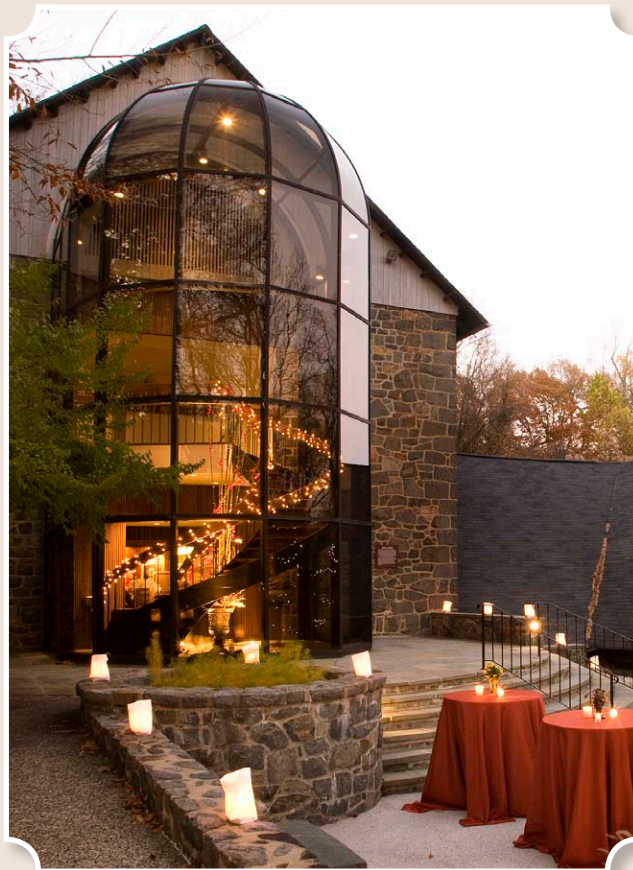
Hagley's Soda House